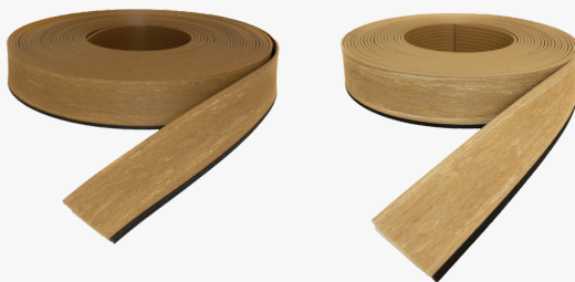
ISITEEK 60 MB

The 60 MW is 60mm wide, comprising a 55mm plank and a 5mm caulk line.