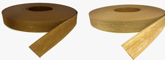
ISITEEK 60 MW