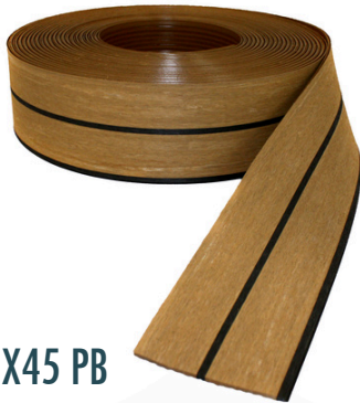
ISITEEK 2X45 PB

The foundation of the Isiteek decking collection is the double plank, which forms the essential structure of the deck. The 2x45 boasts a double plank design, incorporating a tongue and groove system for convenient gluing.