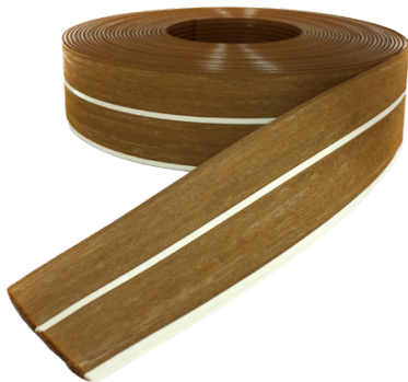
ISITEEK 2X45 PW