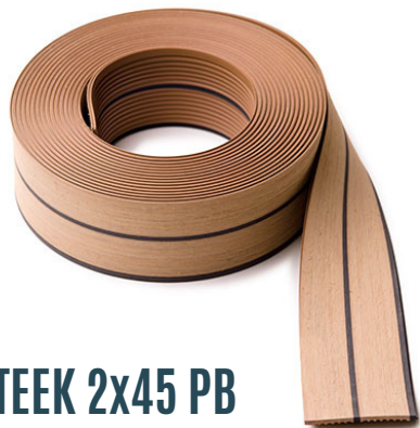
ISITEEK 2x45 PB

The profile itself is 90mm wide, composed of two 40mm planks separated by 5mm caulk lines.