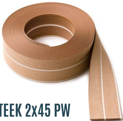
ISITEEK 2x45 PW