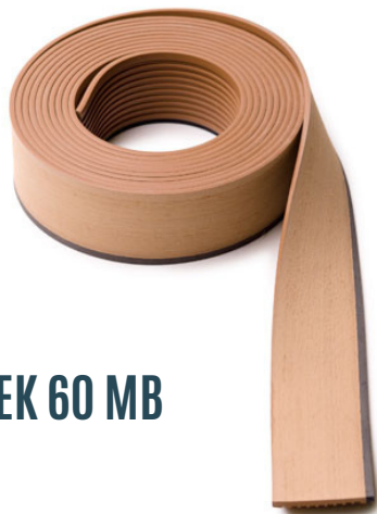
ISITEEK 60 MB

The 60 MW is 60mm wide, comprising a 55mm plank and a 5mm caulk line.