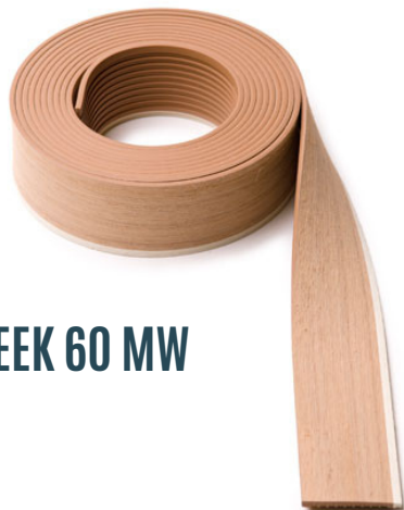
ISITEEK 60 MW